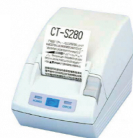
Optional Printer, CT-S280

Specifications subject to change without prior notice. 202102P