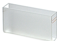
Square Cell (100mm)